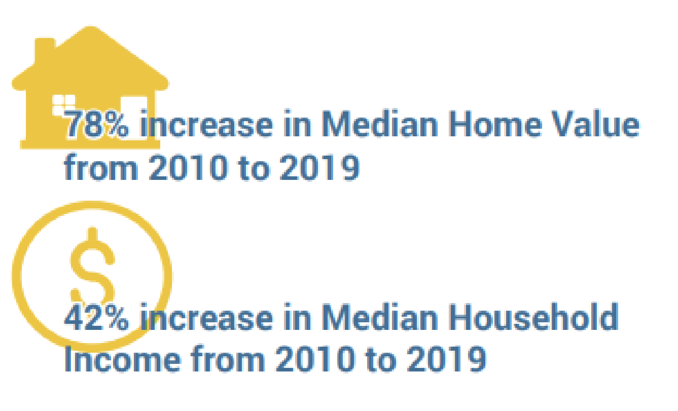
FIGURE 6. WASHOE COUNTY MEDIAN HOUSEHOLD INCOME AND MEDIAN HOME VALUE